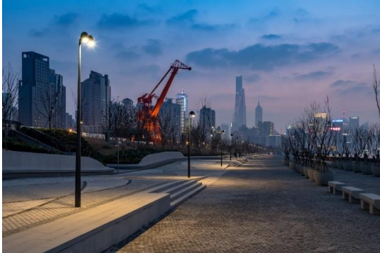
The East Bund waterfront, Shanghai, Autumn 2017